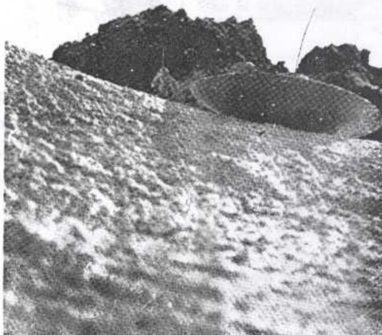
Monguzzi photograph, showing "Humanoid"

Personally, I have always felt that the photographs were far more likely to be genuine than not, and I now note with much interest that, in a footnote